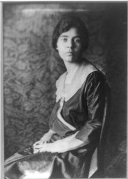
Alice Paul, 1918

National History Day Contest Rule Book Students must include a brief credit, on the exhibit itself, for all visual sources (e.g. photographs, paintings, charts, graphs, etc.). They must also fully cite these sources in their annotated bibliography. (See: IV. Individual Category Rules – B. Exhibit, Rule B4, pages 24-25)